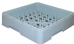
Cod. 901505 x 2